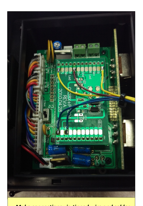
Make connections via tinned wire and solder pads. This top PCB can be removed from its socket, if needed, to separate the coal load electronics from the loco.