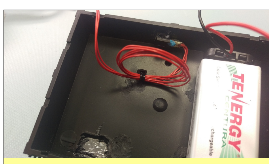
IR Sensor peeks out the back of the coal load. 3/16" hole and super glue.