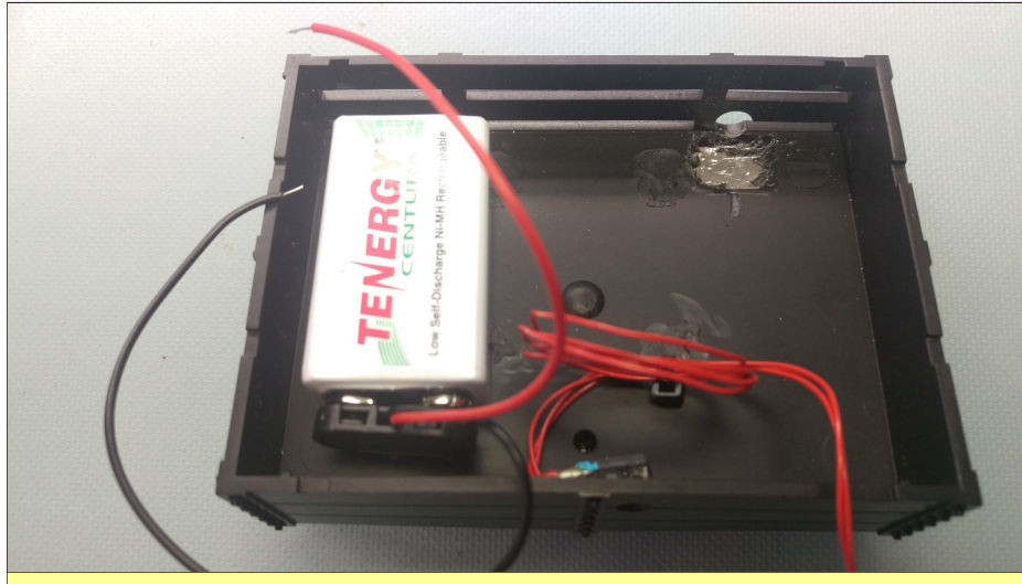
Battery On/Off switch is mounted between slits. 1/4" hole, plus milled out area for switch body.