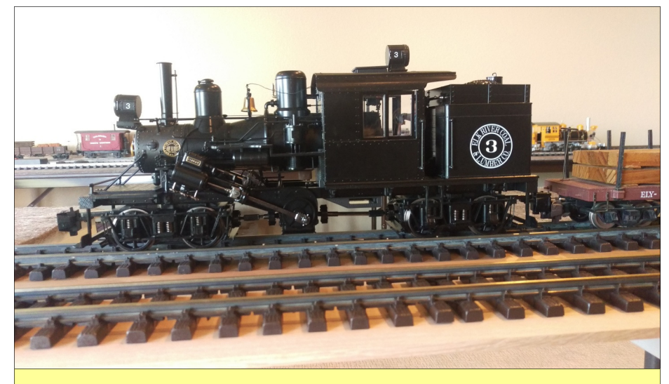
New Bachman Climax with removable coal load on top of the bunker. Inside of the bunker is filled with factory electronics and a speaker.

Mount the battery on/off switch (SPDT) to the front of the removable coal load such that it is accessible from the left side (fireman's side) of the loco. Drill a 1/4" hole between the slats. Then mill out plastic for the body of the switch so it sits flush and can be