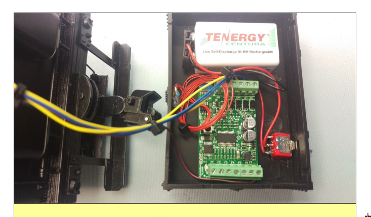
Wire length is long enough (9") for coal load to be removed and lay down behind loco.