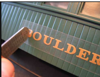
Burnish prior to tape removal

If you applied the transfer over grooved siding, burnish the tape/transfer before removing the transfer tape to make the vinyl conform to the shape. Use a narrow tool e.g. lead pencil or a dull toothpick.