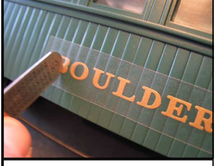
Burnish prior to tape removal

If you applied the transfer over grooved siding, burnish the tape/transfer before removing the transfer tape to make the vinyl conform to the shape. Use a narrow tool e.g. lead pencil or a dull toothpick.