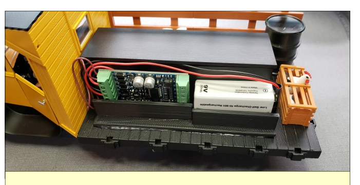
MLS board and 9V battery contained by 3D printed "fence"