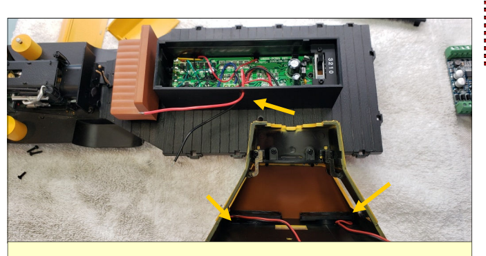
Track power wires routed out of factory electronics box. Two small speakers were mounted in roof of the cab.