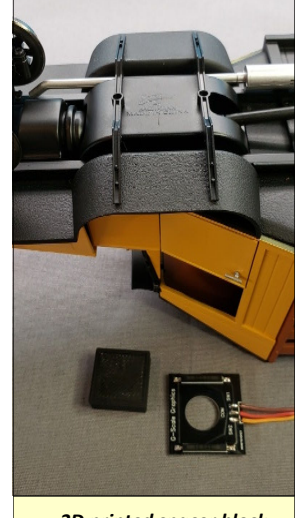
3D printed spacer block and reed switch PCB

The 9V battery is required for track power. The remote IR sensor allows volume changes, sound triggers, and user configuration changes using a simple TV remote.